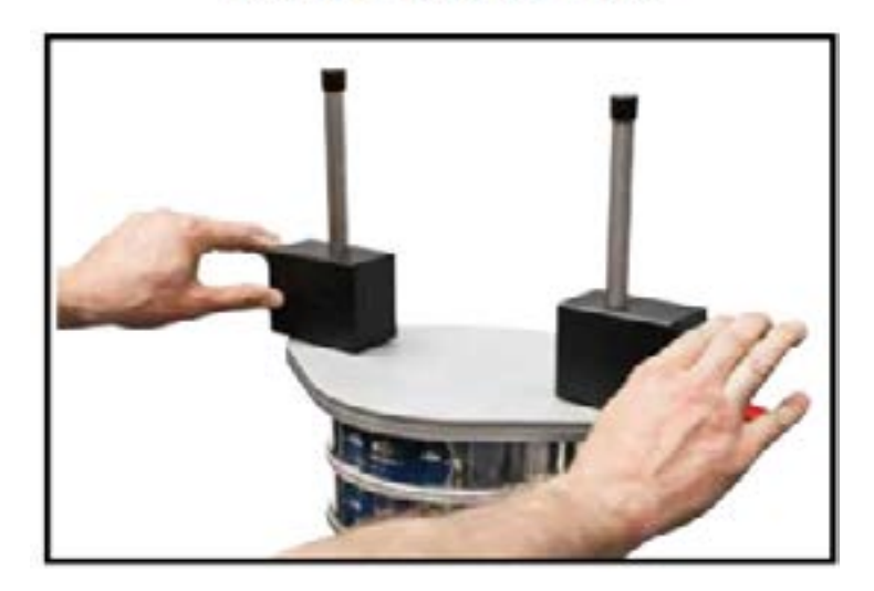
Clamping down the sieve stack