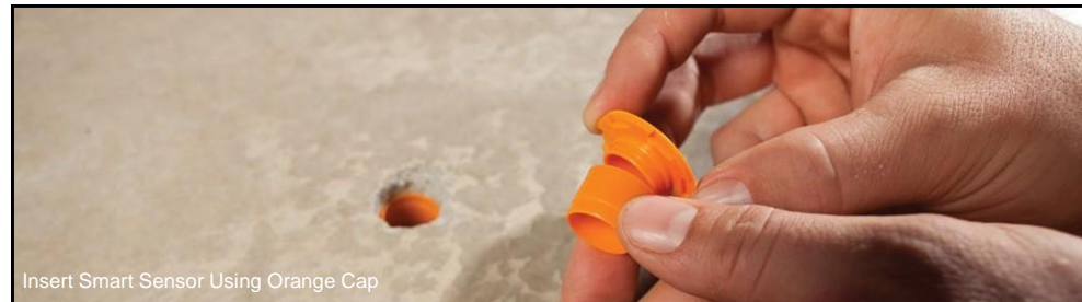
Insert Smart Sensor Using Orange Cap

Caution: NEVER use your reader device (either the Smart Reader or the Easy Reader) to install the Smart Sensor.