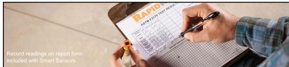
Record readings on report form included with Smart Sensors

*Rapid RH® Easy Readers that display temperature in Celsius can be identified by their blue labels and blue plastic protective caps.