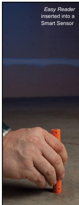
Easy Reader inserted into a Smart Sensor

In most cases, one hour after installation, the Smart Sensor will generally give a reading within 3-5% RH of the reading you would see after the ASTM-required 72-hour mark. Just remember to follow the ASTM F2170 procedures pertaining to equilibration time.