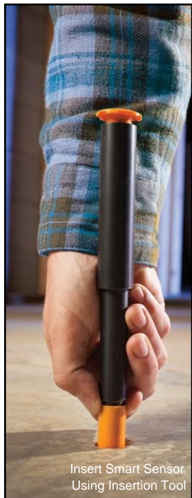
Insert Smart Sensor Using Insertion Tool

Directly out of the package, the Smart Sensor is 1.6" in length or 40% of a 4" thick slab. ASTM F2170-11, Section 10.2 states: "Slab drying from top only (example: slab on ground with vapor retarder below, or slab on metal deck): 40% depth. Slab drying from top and bottom (example: elevated structural slab not in metal deck): 20% depth)." Each Smart Sensor pack includes a number of short (0.4") extensions that can be inserted into the Smart Sensor barrel to enable use in thicker slabs. Adding one insert extends the Smart Sensor barrel length to 2" for testing 5"-thick slabs to the 40% depth. Keep any unused extensions for future jobs. If needed, you can use additional extensions to increase the length of the sensor barrel for thicker slab applications.