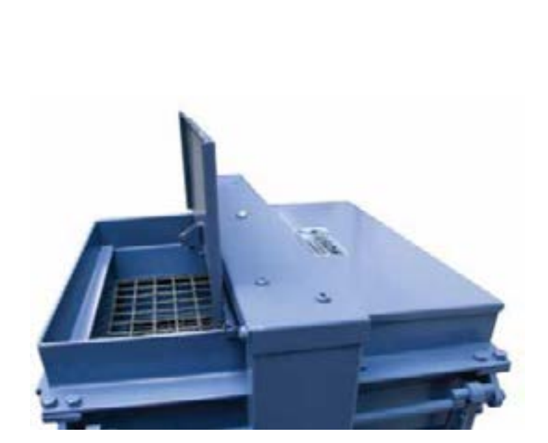
PS-3 Porta Cover