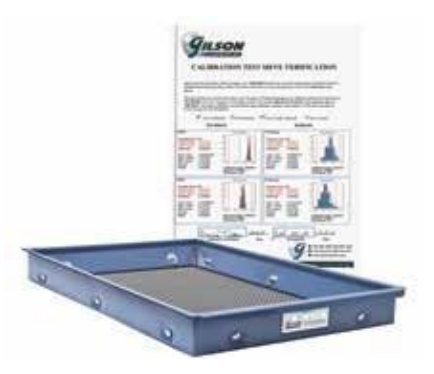
GV-66 Calibration Verification shown with Screen Tray