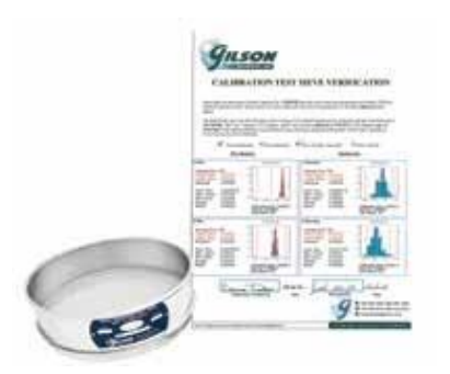
GV-65 Calibration Verification shown with Sieve

All Gilson test sieves meet ASTM or ISO requirements for Compliance Test Sieves. Ordering additional verification services for each individual sieve upgrades them to meet Inspection or Calibration specifications.