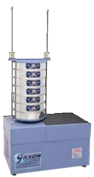
SS-8R Gilson Tapping Sieve Shaker shown with Sieves

<sup>1</sup> Not a standard ASTM E11 size.